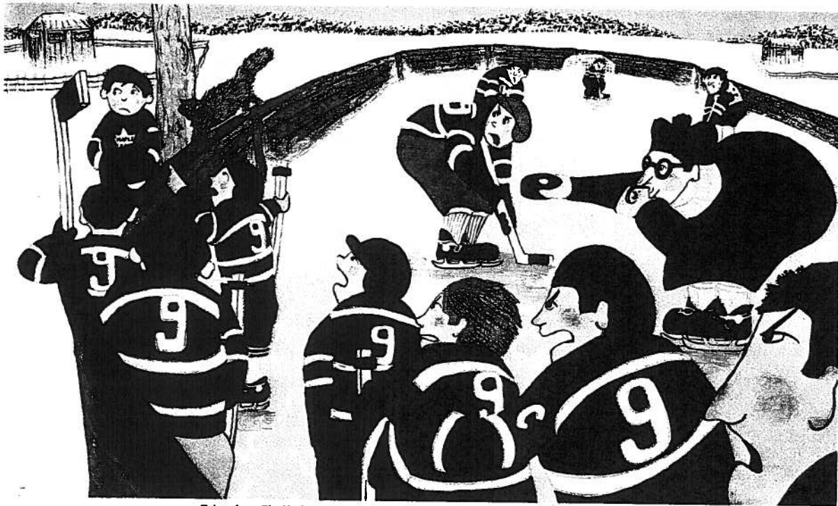
Taken from The Hockey Sweater : illustrations published by Tundra Books.