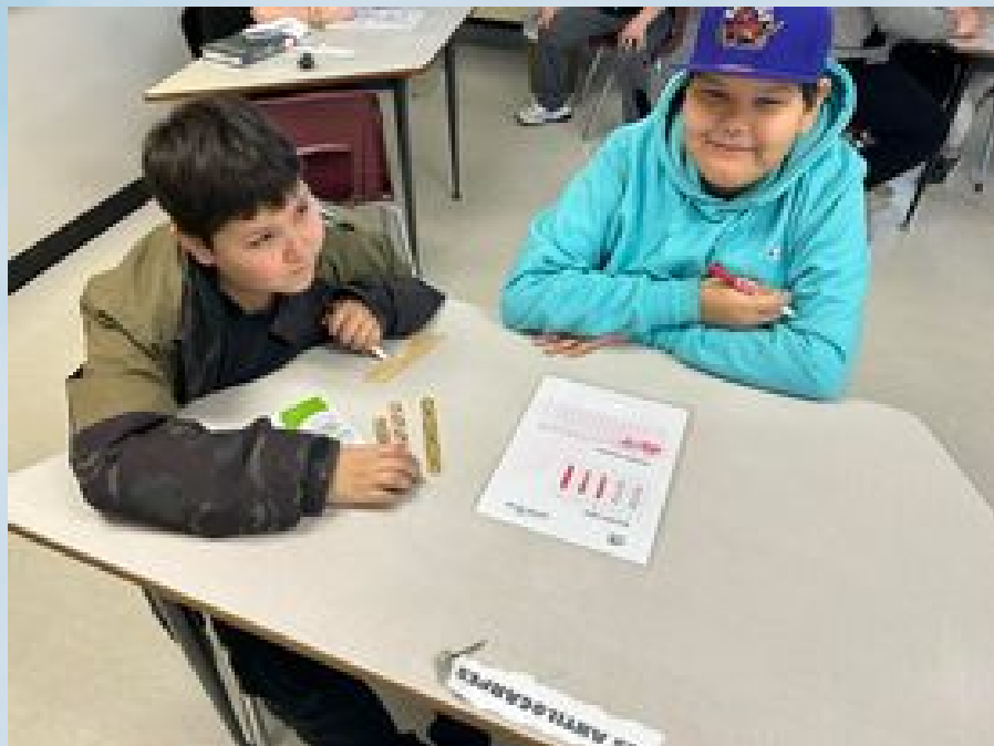
The bone game for pi day @ GPMS