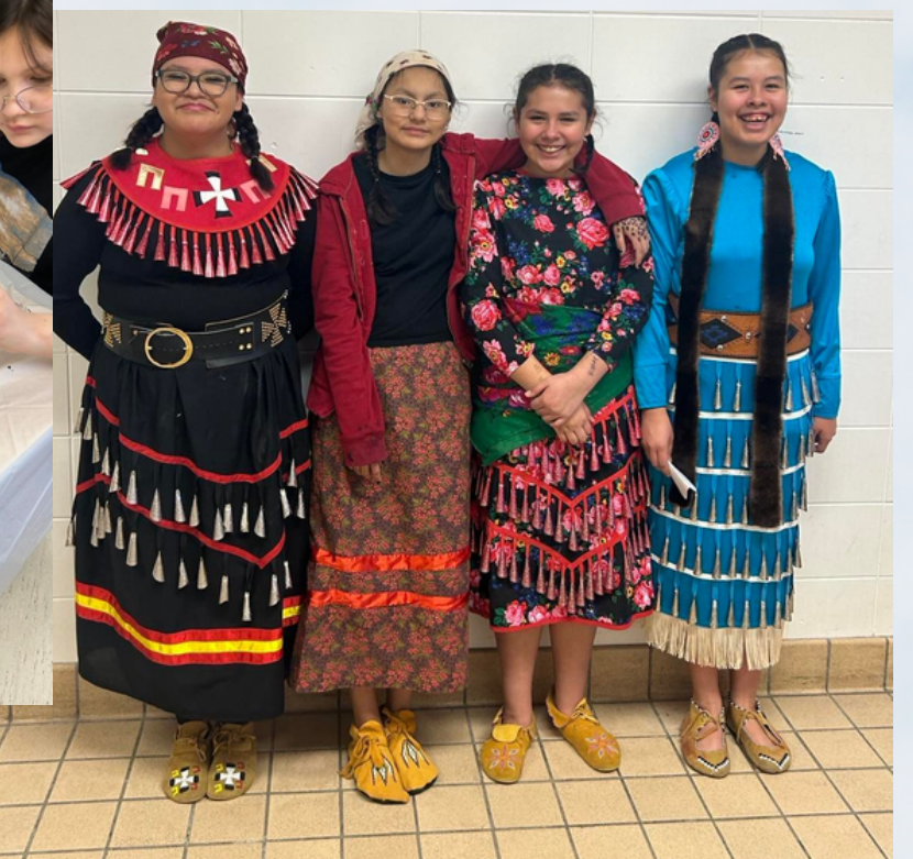
WMS students dancers at Churchill's culture showcase