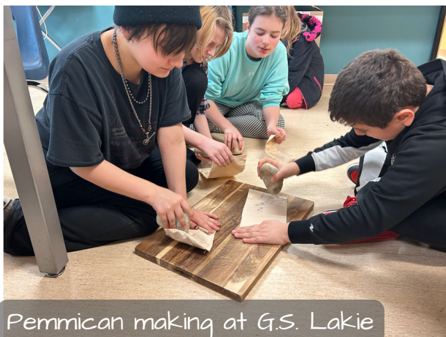
Pemmican making at G.S. Lakie

Check out what our Middle School's did this month!