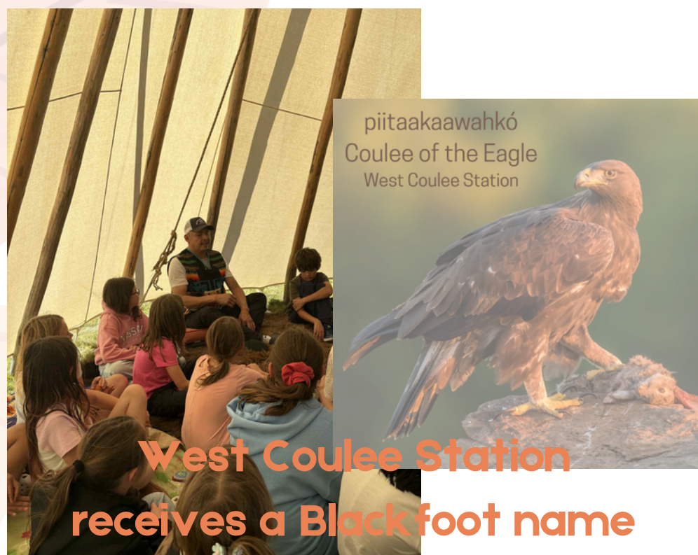
West Coulee Station receives a Blackfoot name