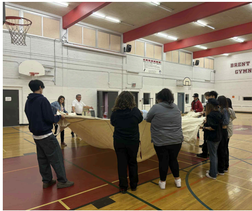
Some Vic Park students learn about the Tipi