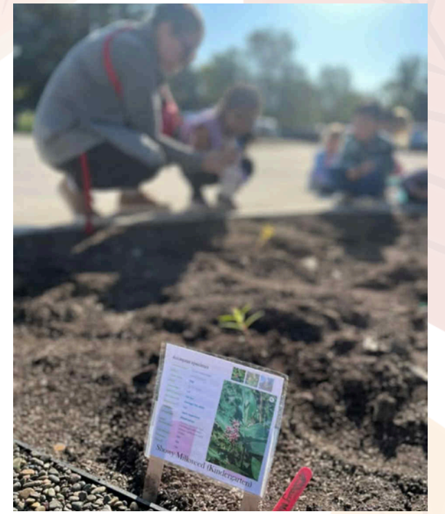
Nicholas Sheran students planting their Indigenous garden