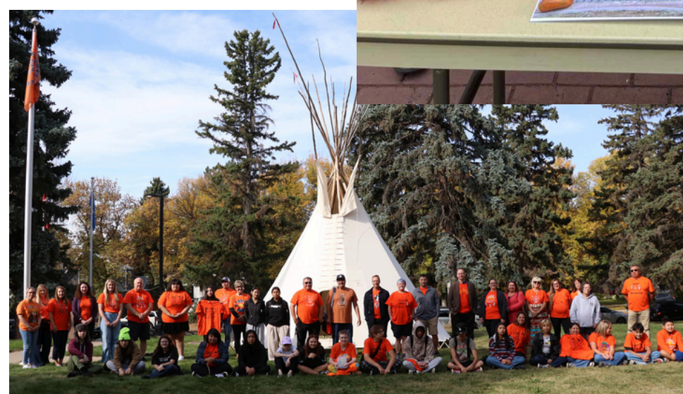
Orange Shirt Day at Aakaipookaiksi