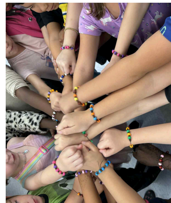
Westminster students learn about the Wolf Willow seed