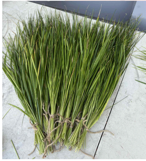
Probe students braided Sweetgrass