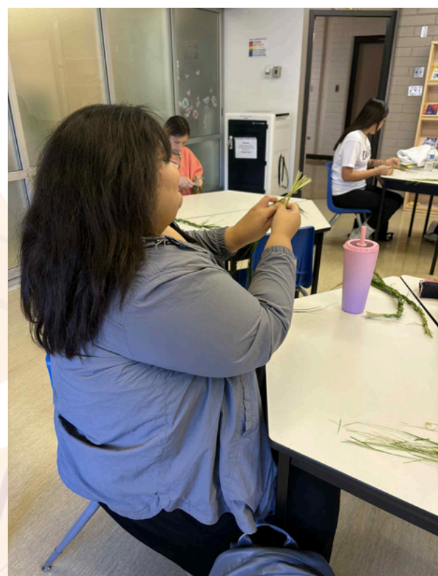
Vic Park students braid sweetgrass