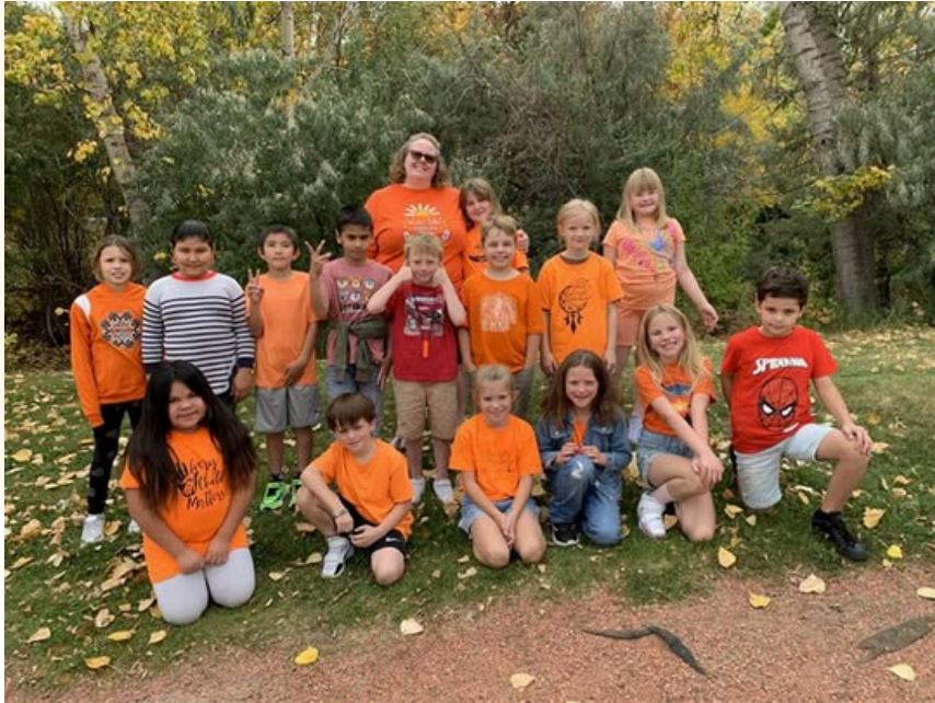
Orange Shirt Day at Nicholas Sheran