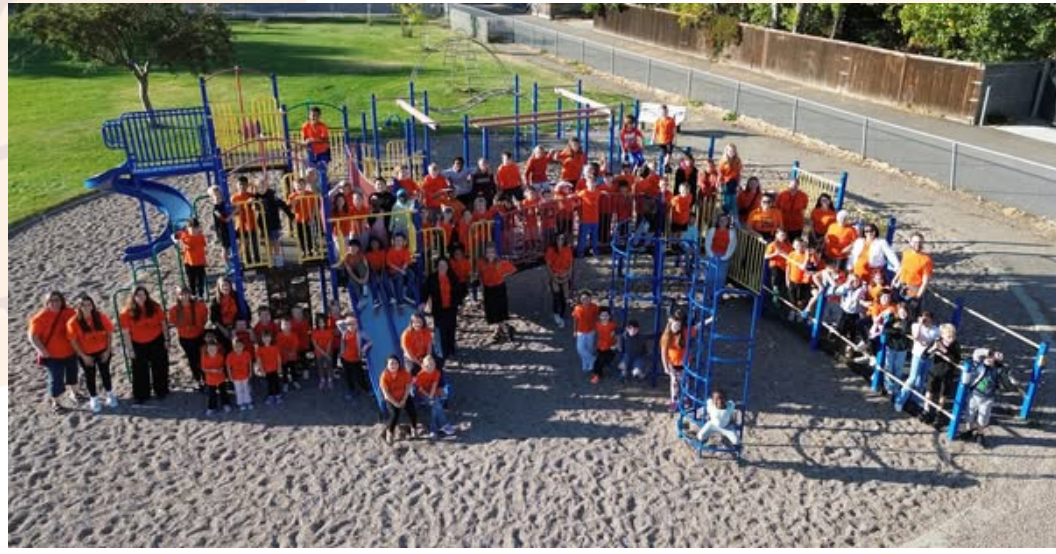
Orange Shirt Day at General Stewart