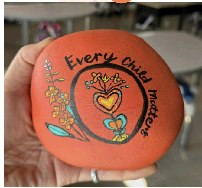
Students at Buchanan painted orange rocks