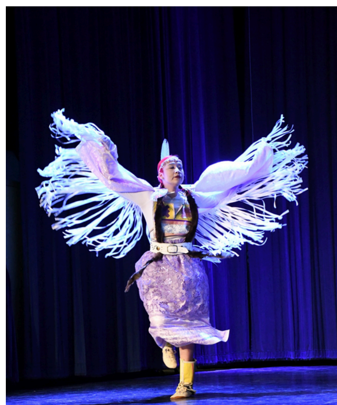
Lakie acknowledges Orange Shirt Day